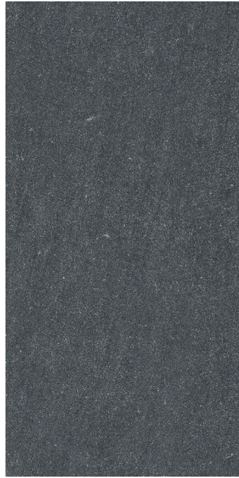
30 x 60 cm (12" x 24") Matte Finish HV.LS.BLK.1224.MT

All items shown in this document are part of Olympia's stocking program. For special orders, please contact your Olympia Tile Sales Representative.